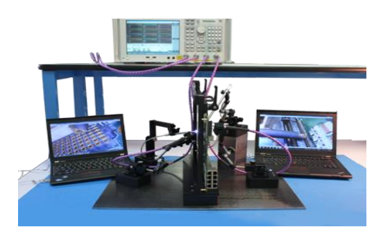
Vertical probing for reducing I-loop coupling