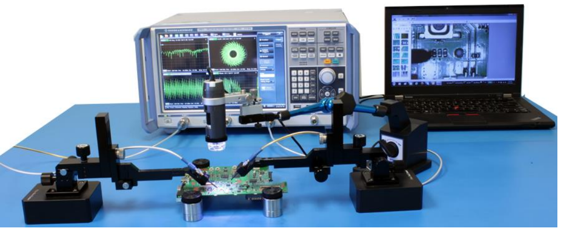
Horizontal power-integrity probing with RProbes, TP60 positioners, and Dino-Lite microscope