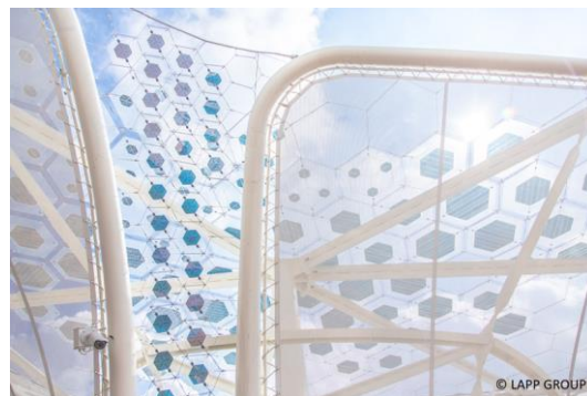
Photo: Special developed BELECTRIC OPV laminates at EXPO2015

Publication and reprint free of charge; specimen copy is requested.