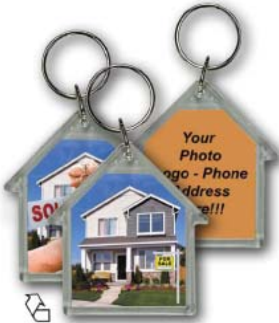
KC01-971 Key Chain Acrylic