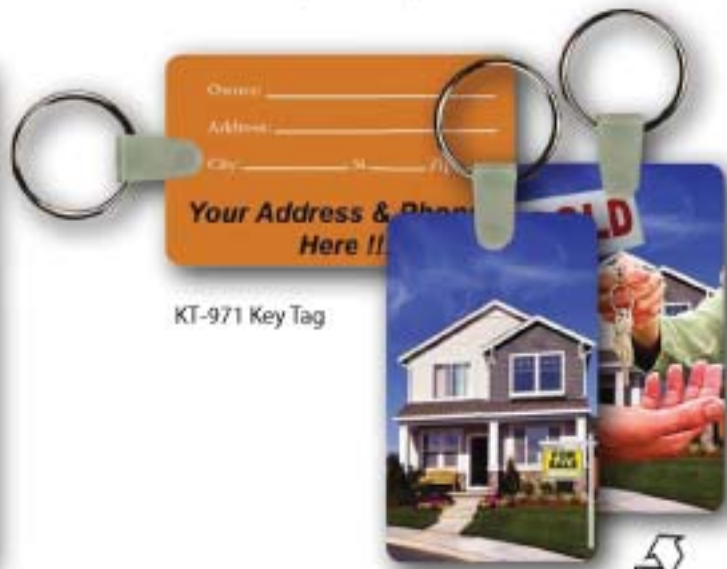
KT-971 Key Tag

Prices are subject to change. For larger quantity pricing & custom designs consult: