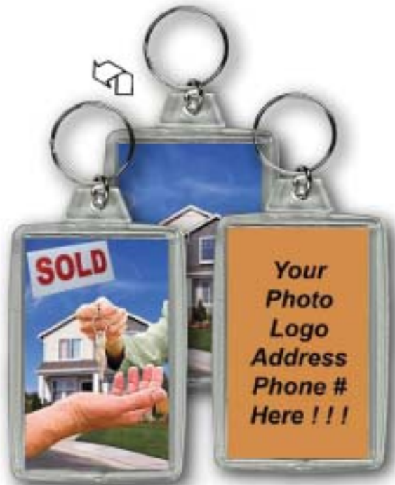
KC02-971 Key Chain Acrylic