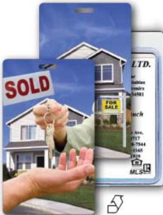
LT01-971 Luggage Tag