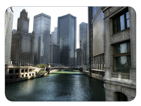
Direct Hit Solutions is based out of Libertyville, IL (Chicago).