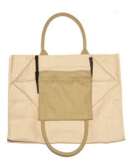
DUNE TOTE WITH CREAM LEATHER