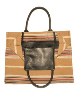
V E R A C R U Z WITH BLACK PEBBLED LEATHER