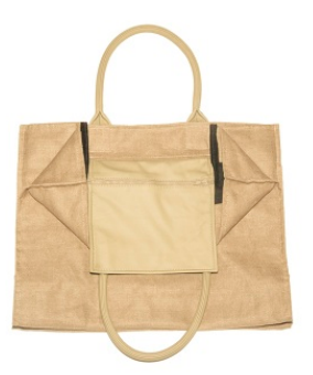
PYRITE TOTE WITH CREAM LEATHER