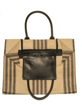
BLACK STRIPE TOTE WITH BLACK PEBBLED LEATHER