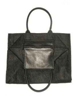
ONYX TOTE WITH BLACK PEBBLED LEATHER