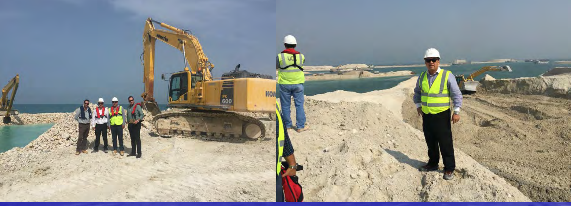
EXECUTIVE DIRECTOR – CONSTRUCTION AND PROGRAM MANAGEMENT